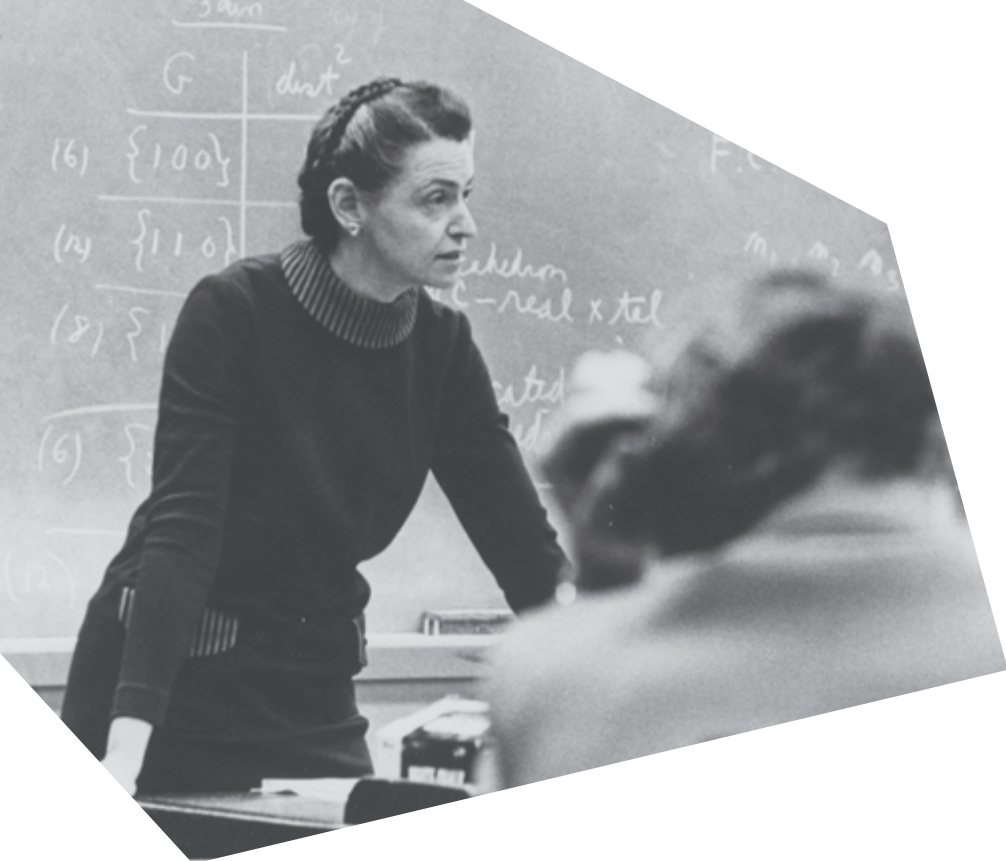
Mildred Dresselhaus

A donation of the papers of Mildred Dresselhaus, late Institute Professor Emerita of Physics and Electrical Engineering and Computer Science, is also forthcoming. Dresselhaus, whose work paved the way for much of today's carbon-based nanotechnology, was also known for promoting opportunities for women in science and engineering. Discussions with additional faculty are also underway.