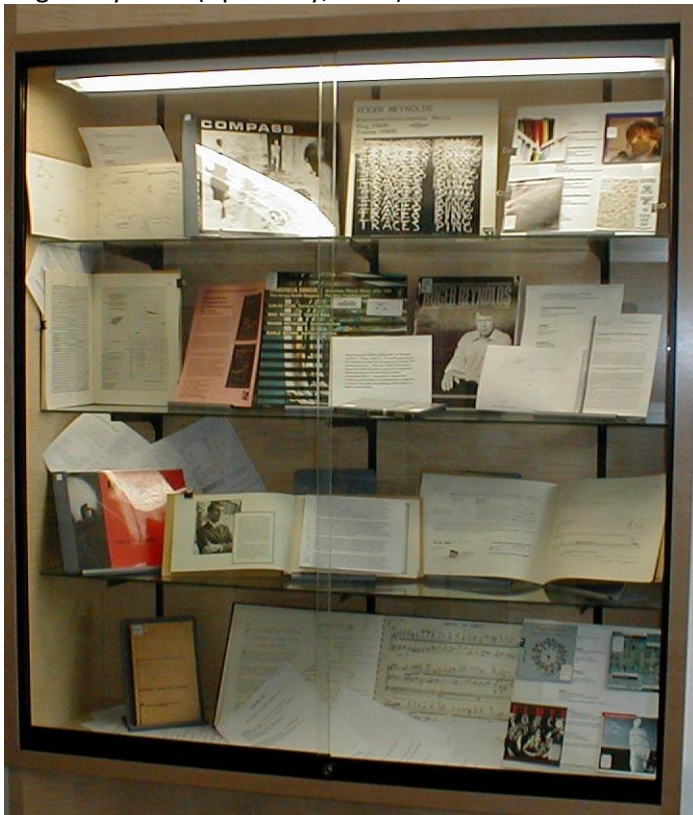
Designed and assembled by David Foxe '03