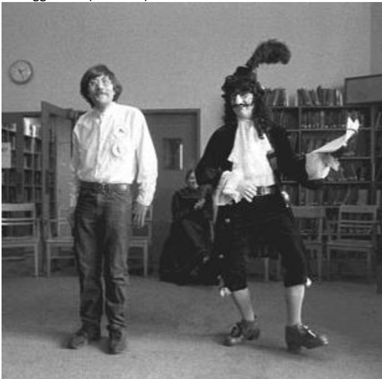
John Lennon and Captain Hook discussed some pretty radical topics