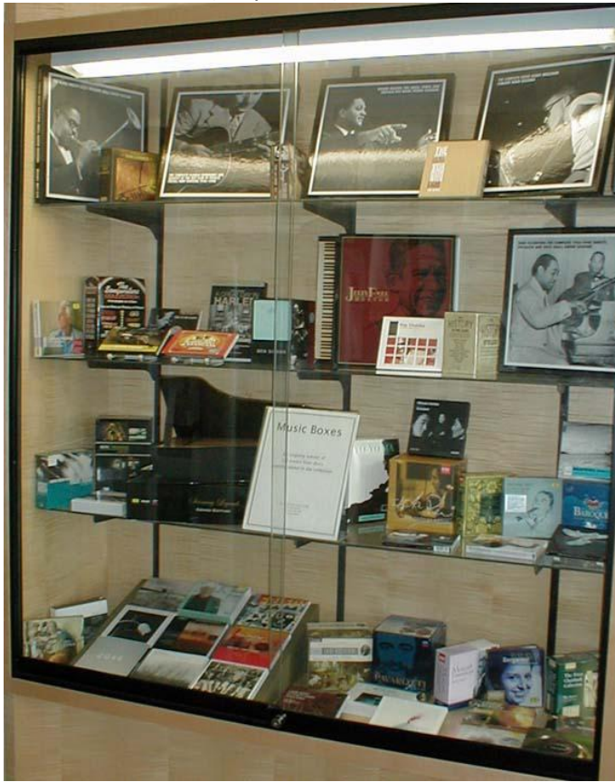
An ongoing exhibit of covers from CD and DVD boxed sets recently added to the collection