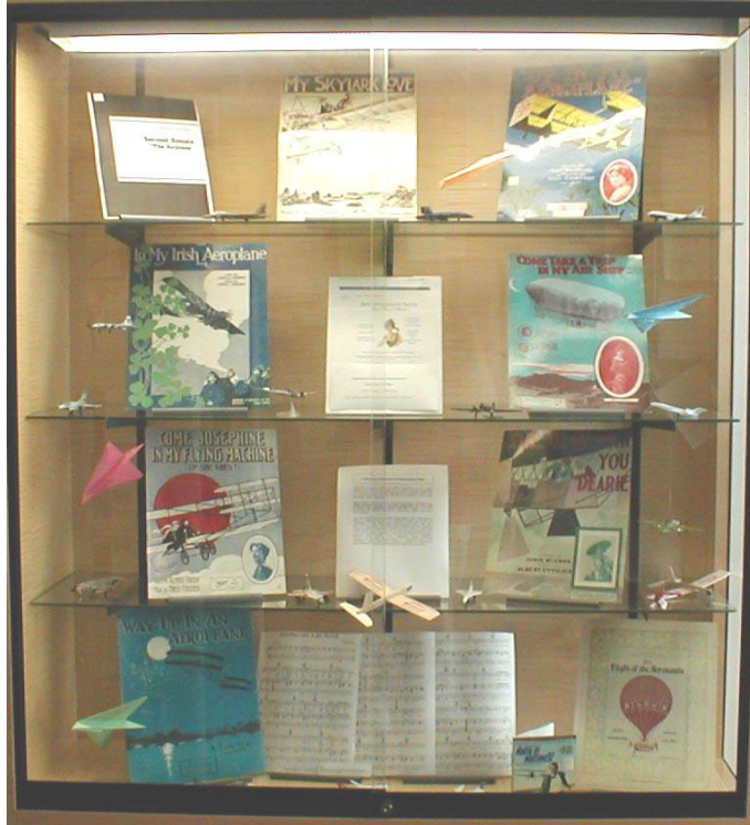
An exhibit on the theme "Ideas Take Flight" was assembled to celebrate 100 years of flight