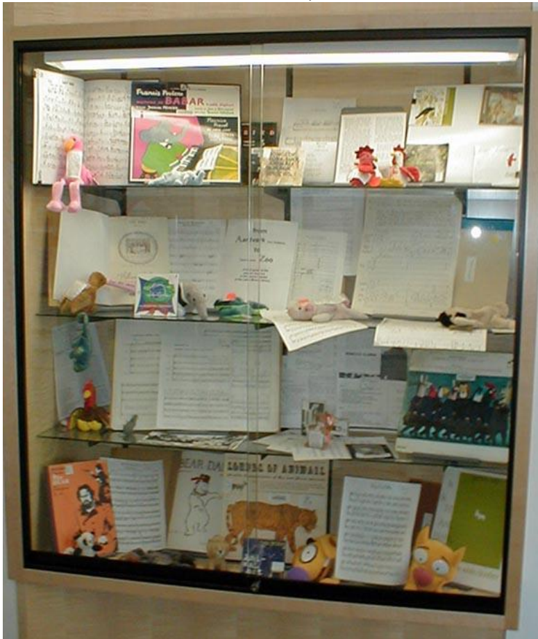
Designed and assembled by David Foxe '03