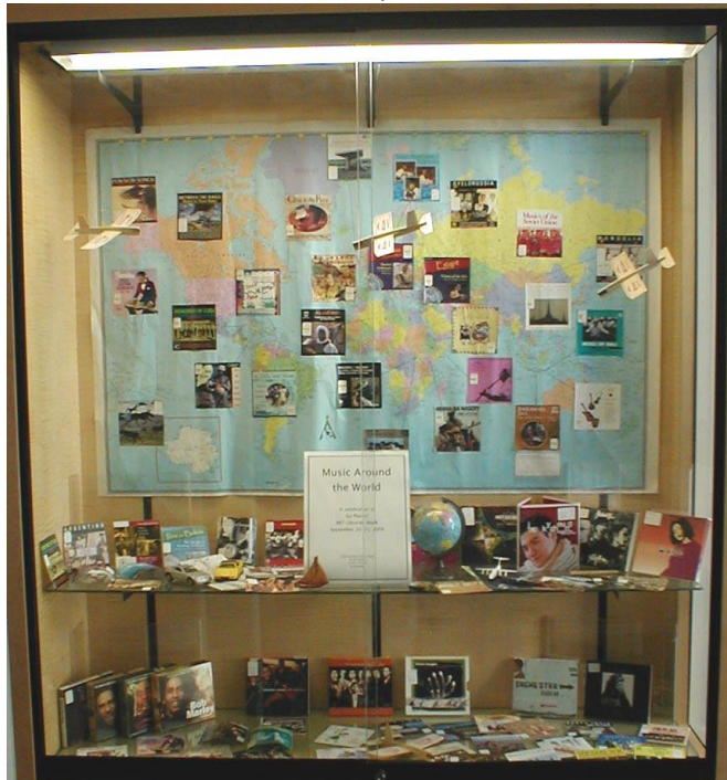
An exhibit in celebration of Go Places! MIT Libraries Week, September 20-25, 2004