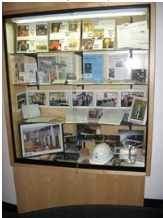
An exhibit celebrating the 10th anniversary of the library's 1996 renovation