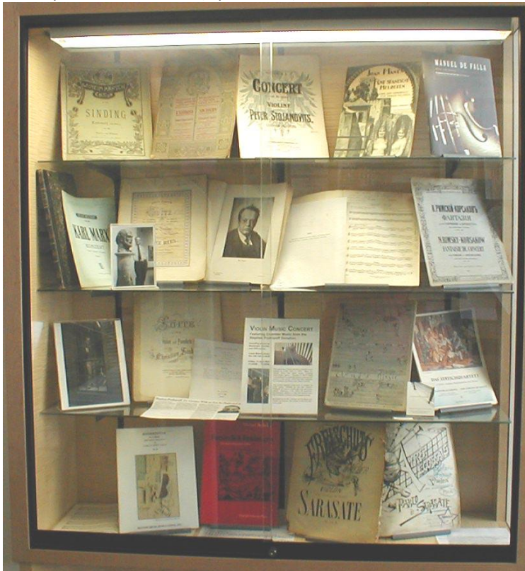
Designed and assembled by David Foxe '03