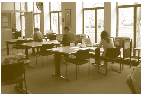
Current Archives reading room