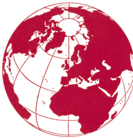
Massachusetts Institute of Technology