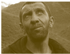
Third prize winner from Window to My World 4

The exhibit at Rotch Library is sponsored by MISTI MIT-Israel and MIT Hillel.