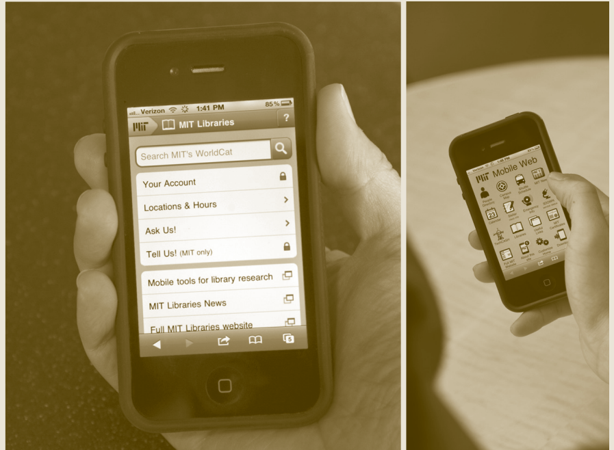
MIT Libraries' mobile website, accessed through MIT Mobile Web