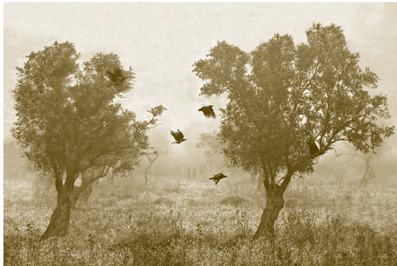
Second prize winner from Window to My World 4

Window to My World 4 – Winds of Change in Galilee is a photograph exhibition open October 17–December 28, 2011 in Rotch Library.