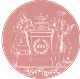
Centennial Celebration 1861–1961