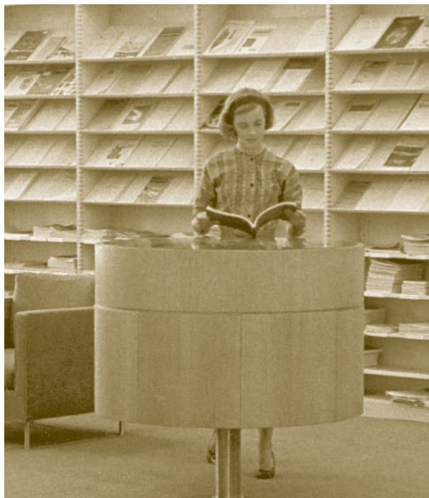
Lindgren Library Circa 1960