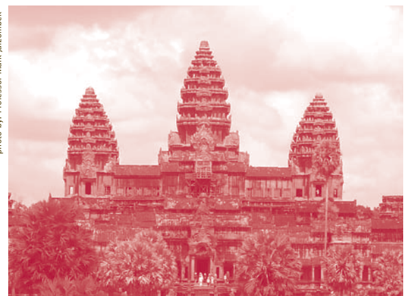
Angkor Wat, west facade, 1140, Angkor, Cambodia