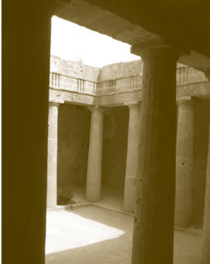
Tombs of Kings Cyprus, Sunken Court 4th Century BCE