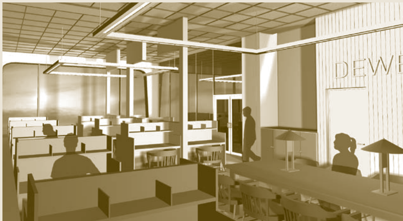
Future 24/7 Study Space

Beginning this fall, Dewey Library will undergo a significant renovation that will enable it to better serve this vibrant community. With funding from the Institute, many upgrades will be made—from basic infrastructure like fire protection and improved ADA-compliance, to the addition of new spaces and technology that will not only serve the needs of today's students, but will also be able to adapt to the needs of the next generation at MIT.