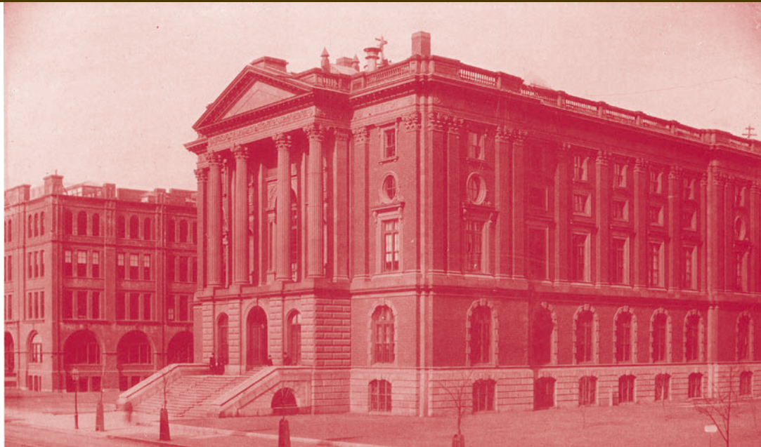
Rogers Building (ca. 1883)