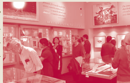
Maihaugen Gallery opening reception