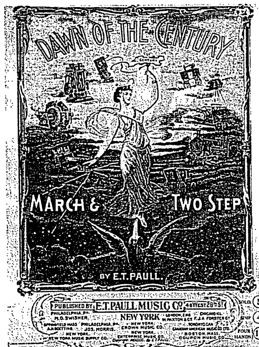
A piece of sheet music from the collection.

The Library wanted to make this music widely available to the MIT community and beyond. Because most of these pieces fall within public domain, it was decided to load them on the Web. In the fall of 1997, a UROP student was hired to create a Web site for this collection as a pilot project. Ten pieces were scanned