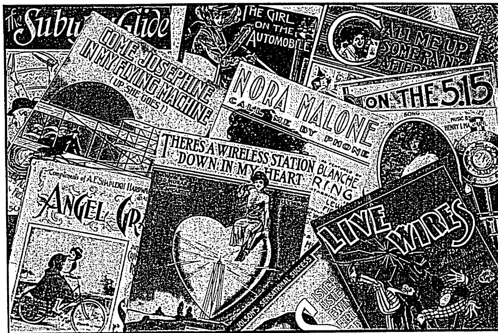
Examples of sheet music from the collection.

maximize the accessibility of this music, full cataloging records will be provided. The project will be completed this spring. You can take a look at: http://libraries.mit.edu/music/sheetmusic .