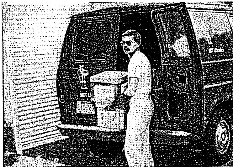
Requested materials on their way to libraries.

Library users can search the journal titles through Barton, or in the microfiche Serials in the MIT Libraries . Bibliographic access to the pre-1963 monographs is provided through the microfiche catalogue of the Dewey Decimal Collection, available in all MIT libraries. Library users may request RSC materials by inquiring at a reference desk in any of the divisional and branch libraries. Requested items are delivered to whichever library the user chooses; delivery is made within 24 hours, except that requests received on Friday will be filled on Monday. The RSC is also open for on-site use 9-5, Monday through Friday, in Building N57, 1 State Street, Cambridge. Users should call 253-7040 for information or to make arrangements to visit the building.