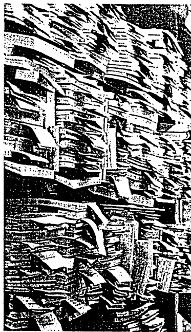
MIT theses waiting to be processed in the Institute Archives.

DAI. The UMI database is recognized as the most widely used information source for theses written in English, and because of its dissemination throughout the world, DAI is seen as important both as a tool for researchers and as exposure for authors.