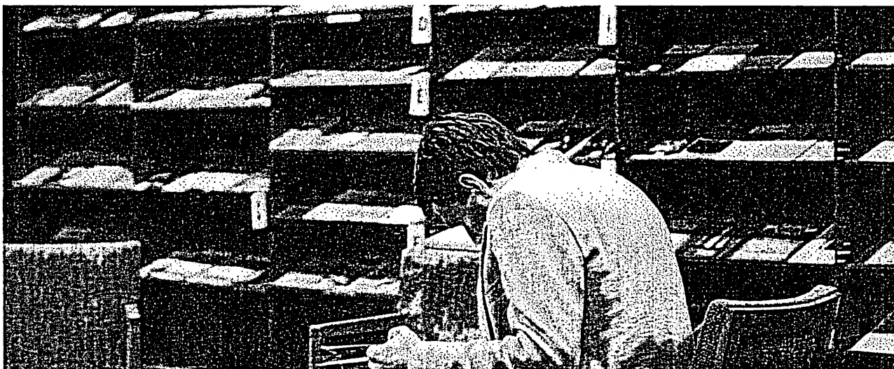
Science Library periodical shelves and reader

The serials cancellation project described elsewhere in this issue resulted in solvency for current serials subscriptions as well as additional funds for monographs and for new serial titles.